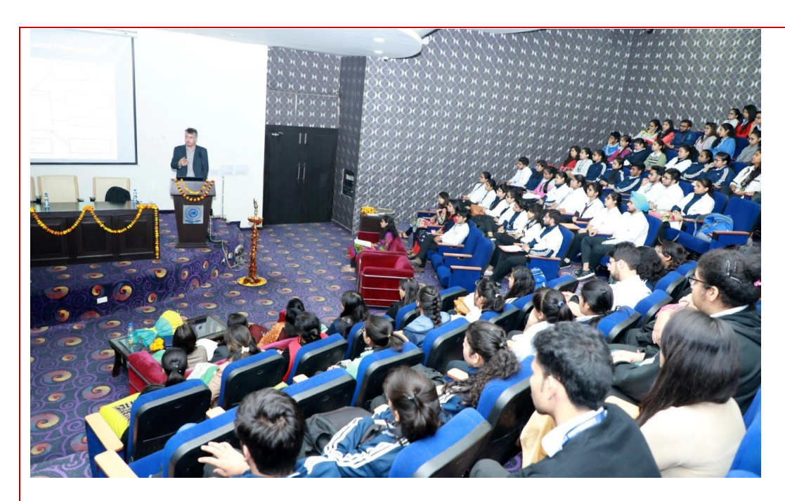
Figure 2: Resource Person addressing the students

He spoke at length about cascade of steps in healing, how physiotherapist can influence faster rate of recovery post injuries. In the talk, the need to give exact time frames to patient with respect to their recovery was stressed.